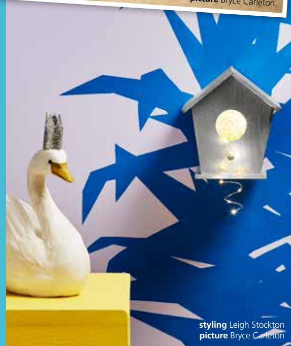
styling Leigh Stockton

Keep the boogie man from your children's door and their fears from flourishing with this cool night light. Get them to help you make it – it's easy. The craft birdhouse is from Spotlight, painted in Resene So Cool metallic paint, while the wall mural, in Resene Splish Splash, is inspired by flax – simply use masking tape for straight lines and go for it; there's no right or wrong with a design like this. We used seed lights for extra sparkle, which are just popped inside the birdhouse, or you can use an LED camp or touch light. The wall is in Resene Zappo, the cabinet is in Resene Shooting Star and the swan is from Tea Pea.