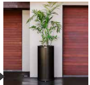
illustration Malcolm White

Cylindrus planter Modscene www.modscene.co.nz 0800 504 004