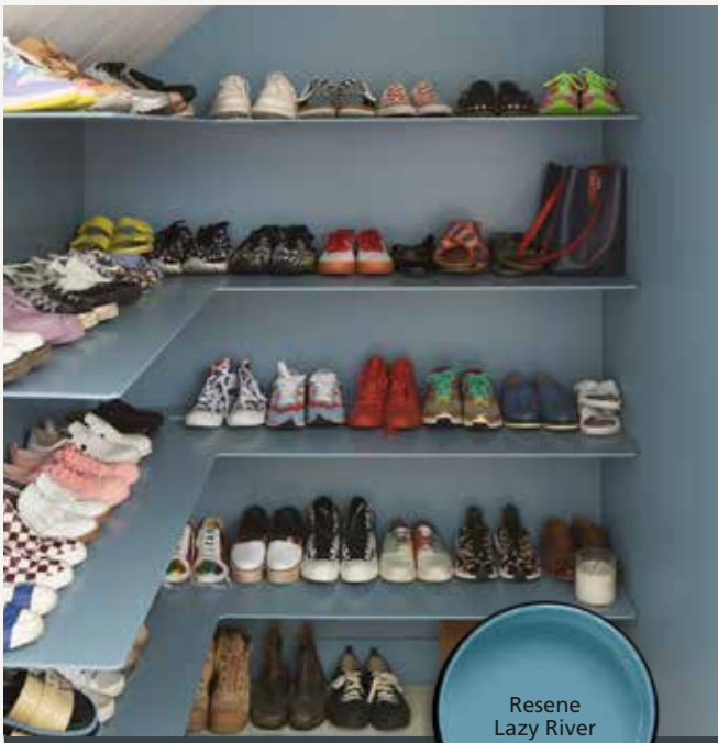
Above: Resene Lazy River turns this functional shoe closet designed by Alex Fulton into a serene, inviting space.