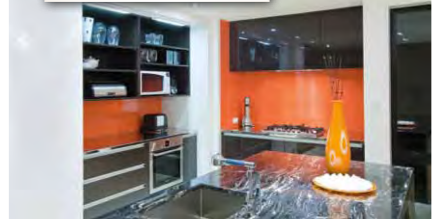
Opposite Page Top: This kitchen takes on a retro look with tongue and groove cabinets finished in Resene Spirulina. The walls are painted Resene Acropolis (Resene Half Tea).