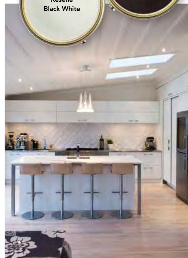
This Page Bottom Right: Set within a mellow frame of Resene Half Sea Fog cabinets and walls, these hand-made textured tiles give this kitchen, by designer Celia Visser, a striking centrepiece. Created for a villa, the kitchen is contemporary without being overwhelmingly modern.