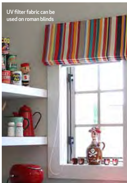
UV filter fabric can be used on roman blinds

FOR KITCHENS AND BATHROOMS, MAKE SURE THEY CAN BE WIPED DOWN