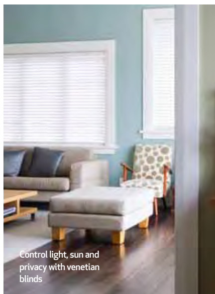
Control light, sun and privacy with venetian blinds