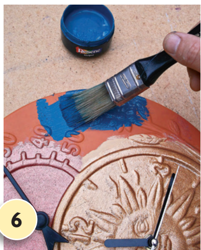
6 Apply one coat of Resene Teal Blue to the rest of the clock, as shown – use a small artist's brush to “cut in” around the details on the thermometer section. Allow two hours to dry.