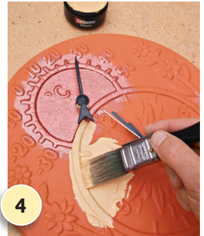
4 Apply one coat of Resene Porsche to the clock section, as shown, and allow two hours to dry.