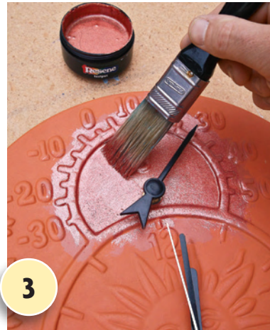
3 Apply two coats of Resene Copper Fire to the thermometer section, allowing two hours for each coat to dry.