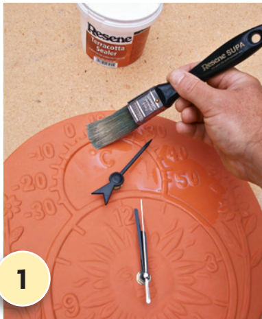
1 Apply one coat of Resene Terracotta Sealer to the garden clock/thermometer and allow to dry.

For more on paints phone 0800 RESENE (0800 737 363) or visit www.resene.co.nz