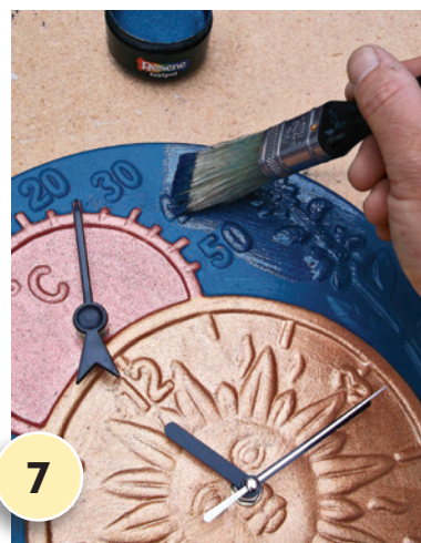
7 Apply two coats of Resene Lucifer to the rest of the clock (again, use a small artist's brush to “cut in” around the thermometer section details). Allow two hours to dry.