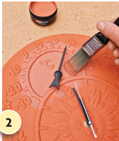
2 Apply one coat of Resene Wild West to the thermometer section, as shown, and allow two hours to dry.