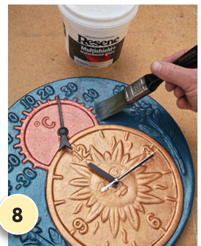
8 Apply one coat of Resene Multishield+ to the garden clock/thermometer and allow two hours to dry. ■