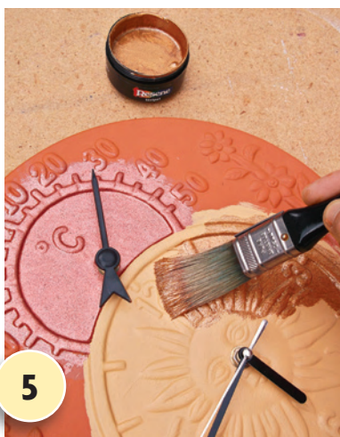
5 Apply two coats of Resene Bullion to the clock section, allowing two hours for each coat to dry.