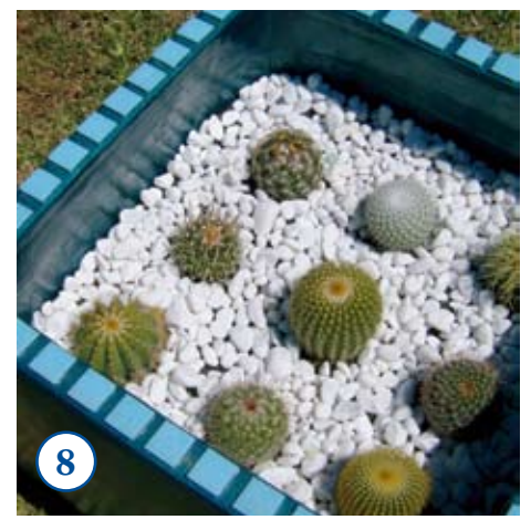
8 FINISH off with a layer of white pebble mulch and place the square of safety glass over the top of the container.

Aftercare: DURING the growing season (September to March) water lightly and feed once a month with low nitrogen fertiliser.