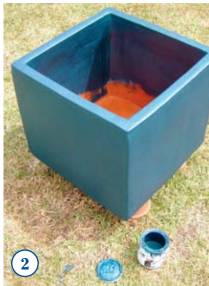
2 USING a paint roller, apply one coat of Resene Teal Blue to the outside of the container. Allow to dry, then apply two coats of Resene Lucifer.