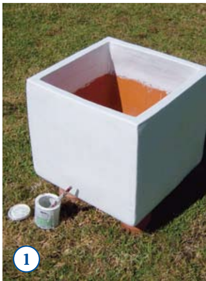
1 SEAL the inside of the container with a terracotta sealer and coat the outside with Resene Quick Dry Acrylic Primer Undercoat. Allow to dry.

MARK used glass mosaic tiles available from Tile Warehouse and Little Cactus Co barrel cacti.