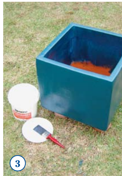
3 USING a brush, apply three coats of Resene Multishield+ Gloss, allowing two hours between each coat to dry.