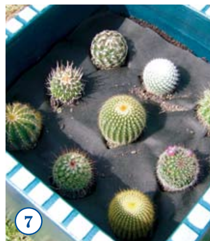
7 PLANT the cacti through the nine holes in the weedmat. Water lightly.