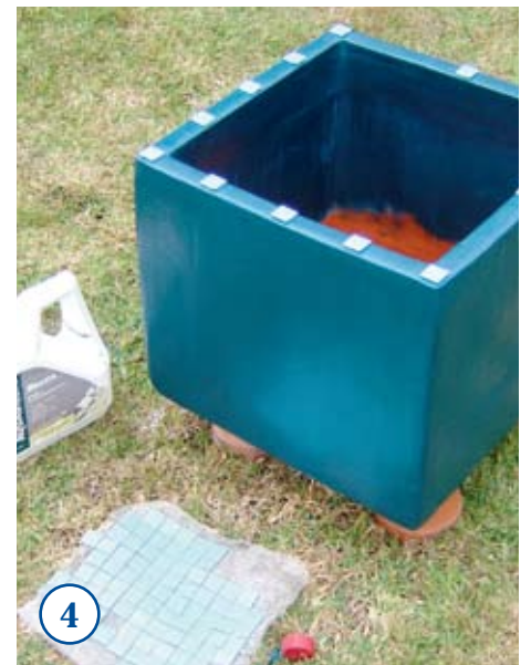
4 USING the PVA glue, apply an evenly spaced line of mosaic tiles around the rim of the container. Allow to dry.