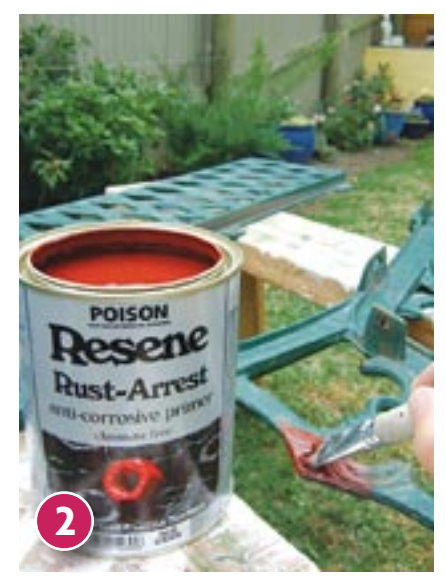
Spot prime the areas of bare iron with Resene Rust-Arrest. Allow to dry for 24 hours.