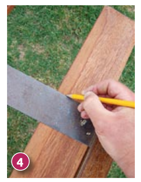
Using the original wooden slats as a guide, measure and cut the decking to size. Our slats were 75mmW x 1.2mL. Measure and cut the two smaller lengths for back panel.