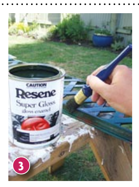
Paint the back panel and end legs with one coat of Resene Black Forest. Allow to dry for 16 hours before applying a second coat.