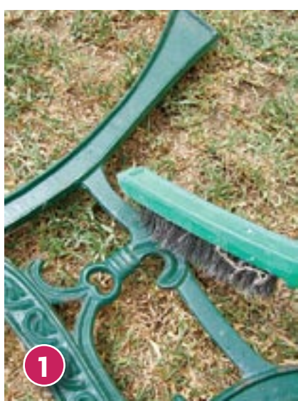
Dismantle the wooden bench. Use the wire brush to remove any areas of rust on the back panel and end legs, as shown.

Mark painted the background retaining wall with Resene Woodsman tinted to Resene Oiled Cedar.