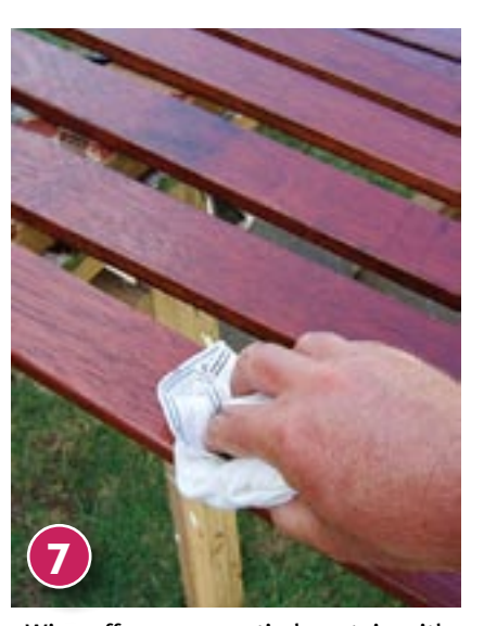
Wipe off any excess timber stain with a dry, lint-free cloth. Allow to dry thoroughly for 24 hours.