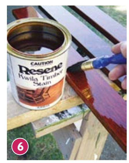
Apply one coat of Resene Kwila Timber Stain to the kwila slats.