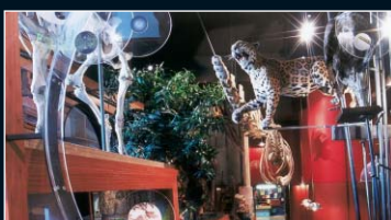
Weird & Wonderful - Discovery Centre

The New Zealand Institute of Architects announced its 2003 Supreme and New Zealand Awards at a Gala Dinner in Auckland, held in conjunction with the bi-annual NZIA Conference. Attended by over 500 guests, these are the most significant professional recognition that architects can receive in New Zealand.