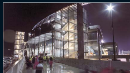
Jade Stadium West Stand Redevelopment

School titan board shell, the Resene Sandtex washed Rockcote plaster finish wrapped Craggy Winery, the Resene favourite neutrals palette of tone on tone of Jade Stadium to