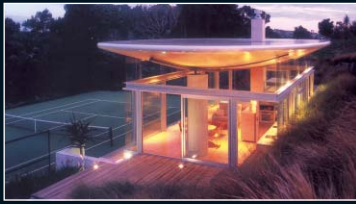
Brick Bay House