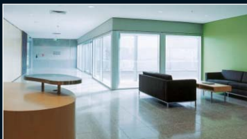
New Zealand Television Archive