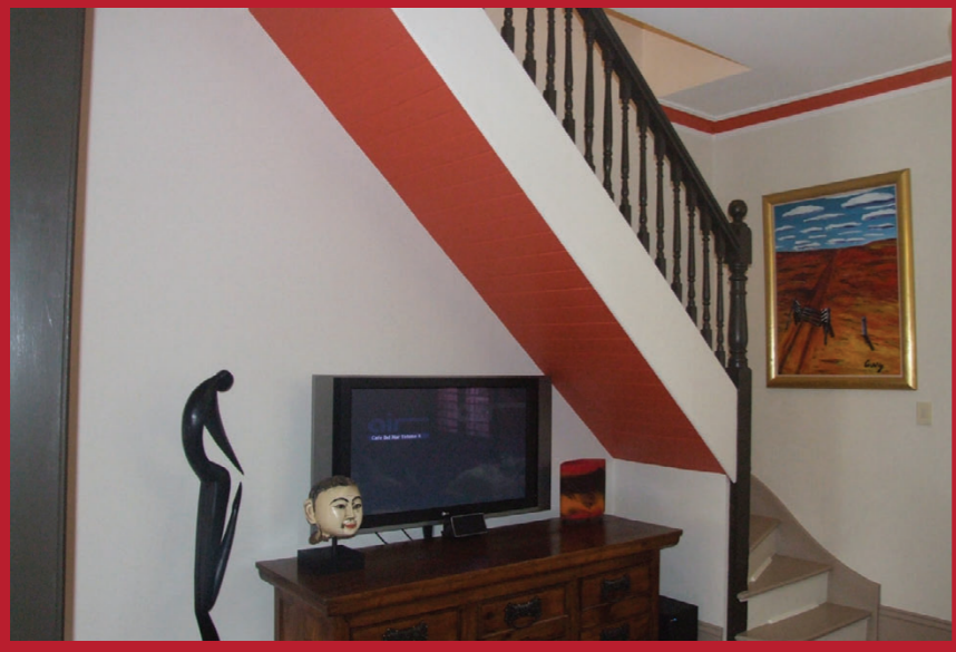
Resene Rock N Roll