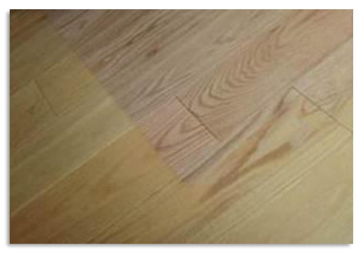
Flooring that has had a carpet rug moved

Colour changes that occur in timbers after they are installed in a building are due to many factors including the amount and type of extractives (the materials that can be extracted easily with organic solvents or water), sap vs heart woods, amount of lignin, exposure to light (visible and UV), exposure to oxygen, temperature and any coatings that may be applied. Understanding of colour changes is not complete although general features are well established. The lack of understanding evolves from the combination of the many different factors that influence colour change occurring at different rates under different conditions.