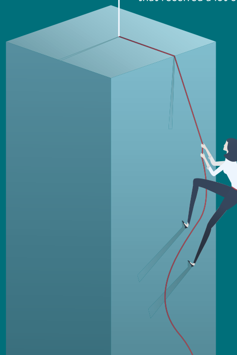
Resene Blue Lagoon

There are times in my position where the ability to be invisible would be quite cool.