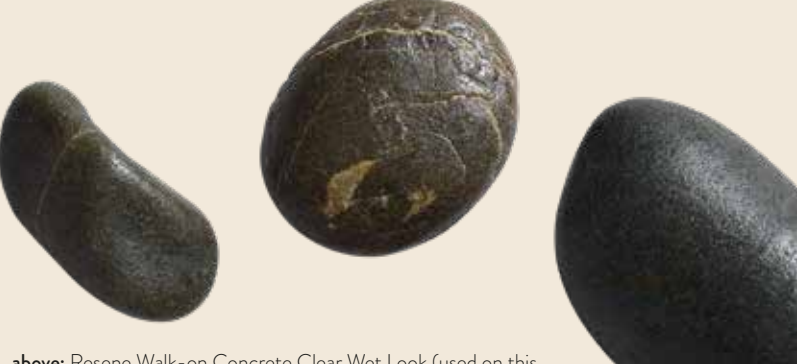
above: Resene Walk-on Concrete Clear Wet Look (used on this series of river rocks) is a solventborne gloss clear designed to achieve a wet look on substrates subject to pedestrian and light vehicular traffic. It penetrates into the concrete to highlight the colour patina of concrete. While it has plenty of uses, it looks particularly great on exposed aggregate driveways.

"I think there is an assumption that if you just pile on more and more material that it's going to help with protection, but that can be a mode of failure. Stains need to penetrate, and if you just keep lashing it on, it's going to build up a film – and that film can end up flaking off, which is not what you want when you go to recoat it. It's important that if the instructions say 'apply