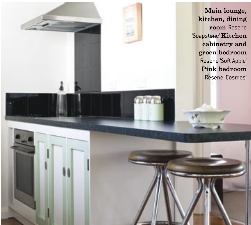
Main lounge, kitchen, dining room Resene 'Soapstone' Kitchen cabinetry and green bedroom Resene 'Soft Apple' Pink bedroom Resene 'Cosmos'