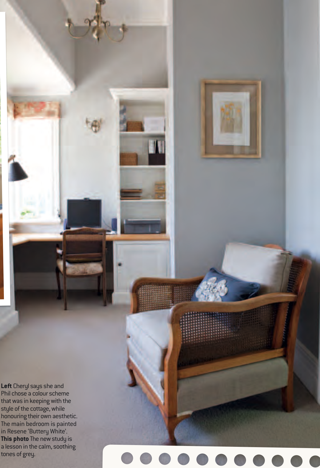
Left Cheryl says she and Phil chose a colour scheme that was in keeping with the style of the cottage, while honouring their own aesthetic. The main bedroom is painted in Resene 'Buttery White'. This photo The new study is a lesson in the calm, soothing tones of grey.