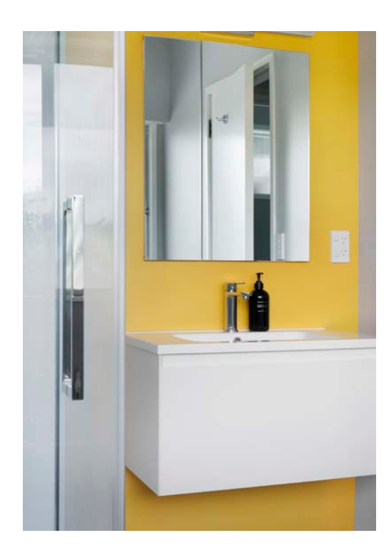
MORE COLOURS TO TRY FROM THE NEW RESENE FANDECK

Keep an eye out for your chance to enter the next Resene Colour Home Awards – they'll be here sooner than you think!