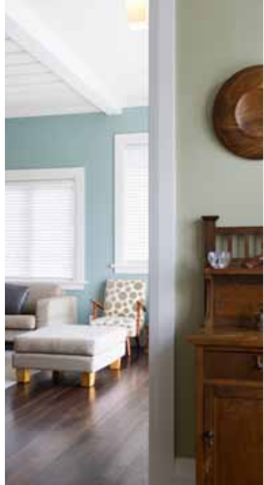
Resene Rice Cake