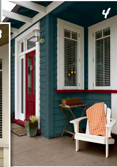
Resene Silver Chalice

Our love affair with the sun, smaller sections and desire for good access to outdoor living spaces can sometimes lead to a clash of purpose. In this case, the front door sits right beside a deck that's used for outdoor living. Colour can help either define or integrate these types of areas, enhancing the appeal of both beyond measure.