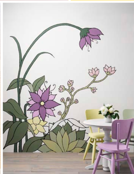
Left: Flower mural in Resene Melodic, Resene Mozart, Resene Gelato, Resene Vanilla Ice, Resene Rivergum, Resene Paddock, Resene Organic, Resene Hideaway, Resene Elixir; Resene Moonbeam, Resene Half Moonbeam and Resene Quarter Moonbeam. Above: Tree in various Resene testpots.