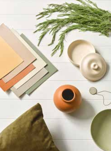
Above: Background in Resene Green White with A4 drawdown paint swatches in (from left to right) Resene Beethoven, Resene Papier Mache, Resene Toffee, Resene Celeste, Resene Zen and Resene Wilderness, bowl in Resene Stone Age, lidded dish in Resene Hampton and vase in Resene Toffee.