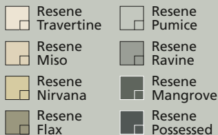
Right: Right wall in Resene Mangrove with Resene FX Paint Effects medium coloured with Resene Ravine, left wall in Resene Ravine with Resene FX Paint Effects medium coloured with Resene Mangrove, floor in Resene Pumice with Resene FX Paint Effects medium coloured with Resene Ravine, large vase in Resene Nirvana, plant pot in Resene Miso and small vases in Resene Travertine and Resene Possessed. Bench and cushion from Bauhaus.