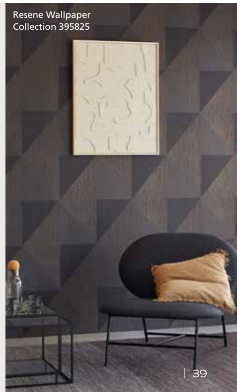
Resene Wallpaper Collection 395825