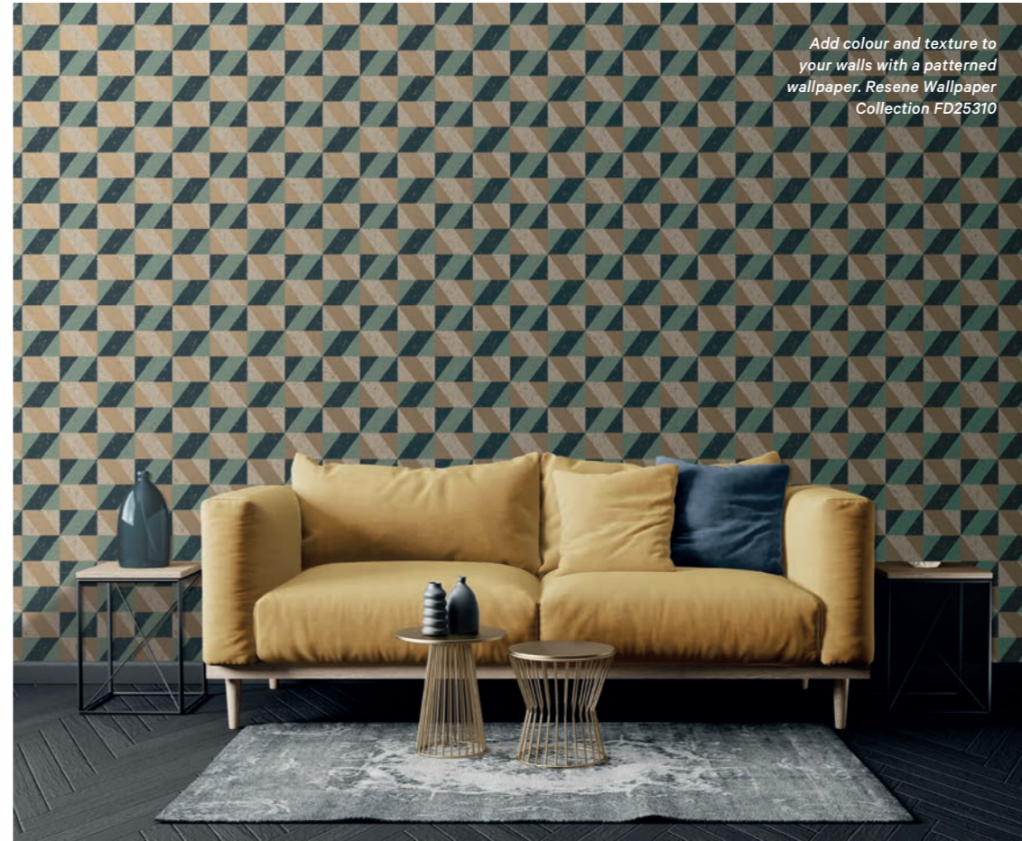
Add colour and texture to your walls with a patterned wallpaper. Resene Wallpaper Collection FD25310