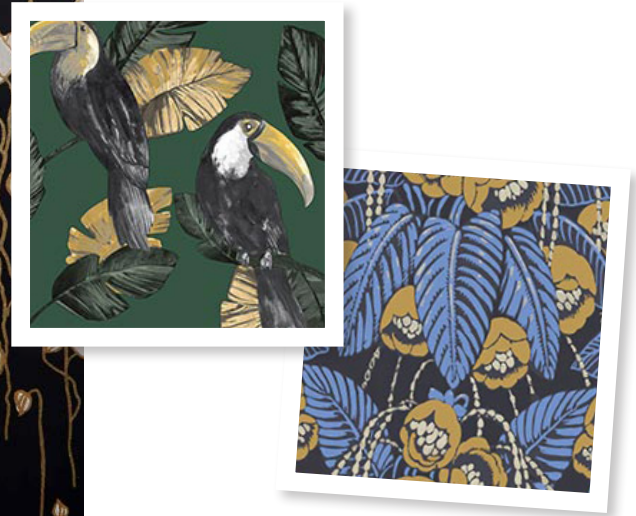
BELOW Resene Agathe Wallpaper AGA302 (left) and Resene Amazonia Wallpaper 91340.

the-wall products, however there are a number of professionals who can lend a hand in getting it on the wall just how you envision, so don't struggle on alone!