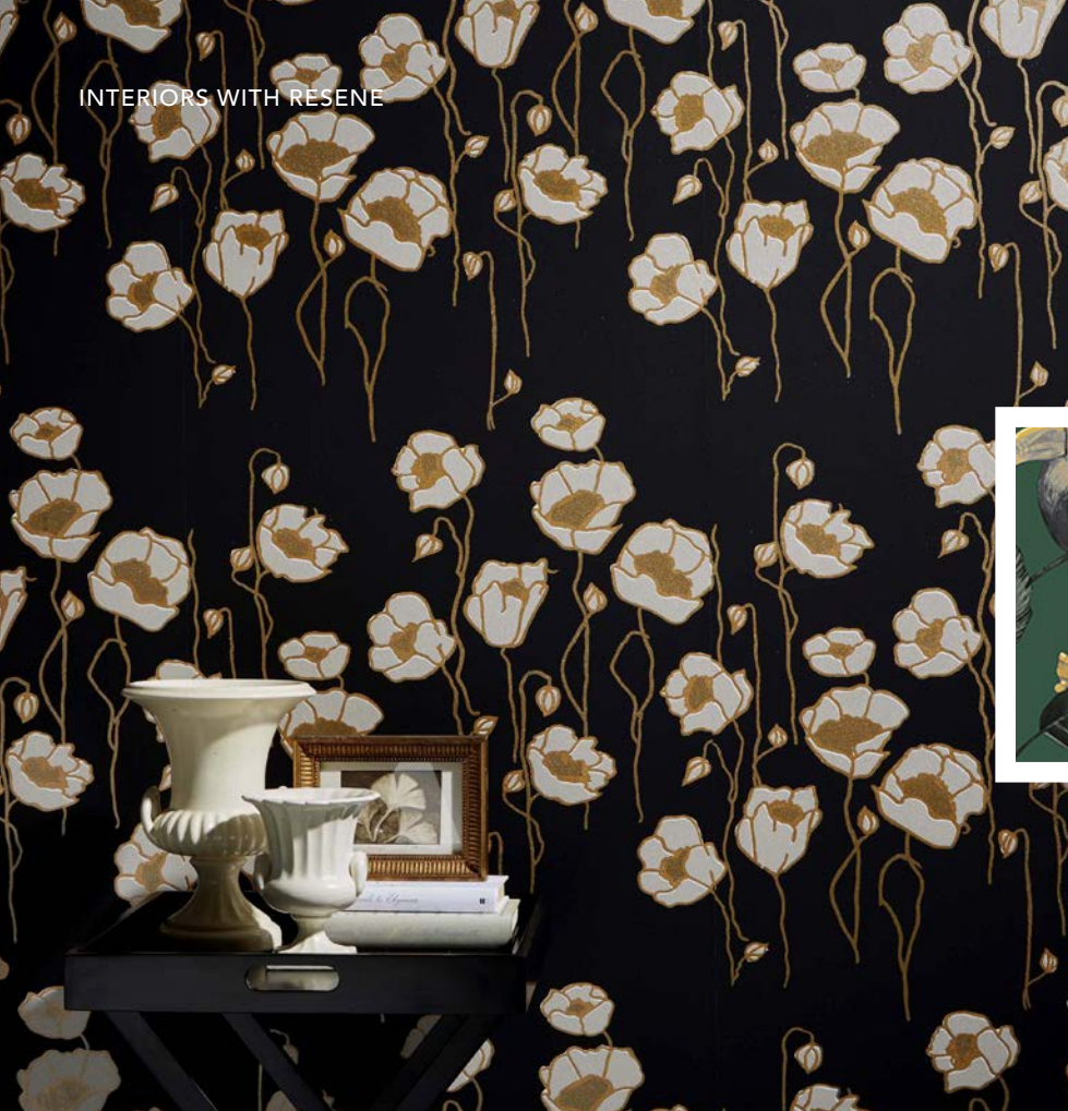
LEFT Mason Poppies MPP01 from the Vintage Mason Handcrafted Wallpaper collection, available exclusively at Resene.