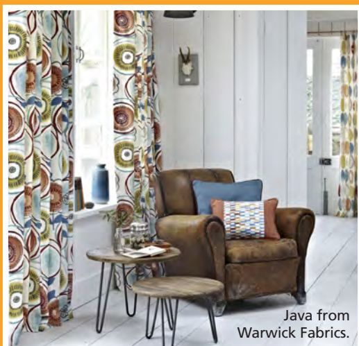
Java from Warwick Fabrics.

Deconstructed stripes, ombre effects and ikat designs give an organic, less tailored look. These more natural lines lend themselves particularly well to curtains, as they are more forgiving of the folds created by the curtain top.