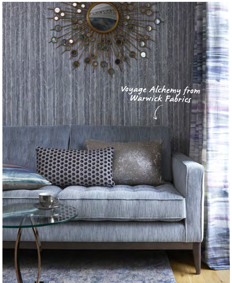
Voyage Alchemy from Warwick Fabrics

Colour co-ordinate: Add a metallic feature wall in one of the many colours from the Resene Metallics and special effects range.