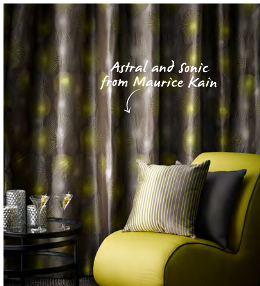
Astral and Sonic from Maurice Kain

Or go bold with rich jewel coloured fabrics that carry a decadent Bohemian vibe: emerald green, purple and ruby red.