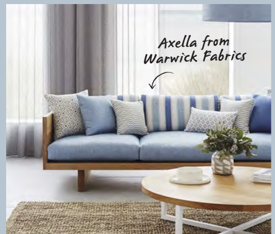
Axella from Warwick Fabrics

Colour co-ordinate: Try Resene Breathless on the walls, a cool blue-grey blend. H