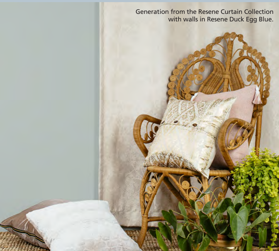
Generation from the Resene Curtain Collection with walls in Resene Duck Egg Blue.