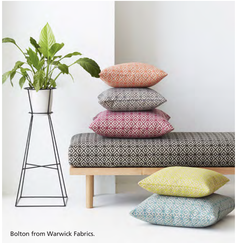
Bolton from Warwick Fabrics.