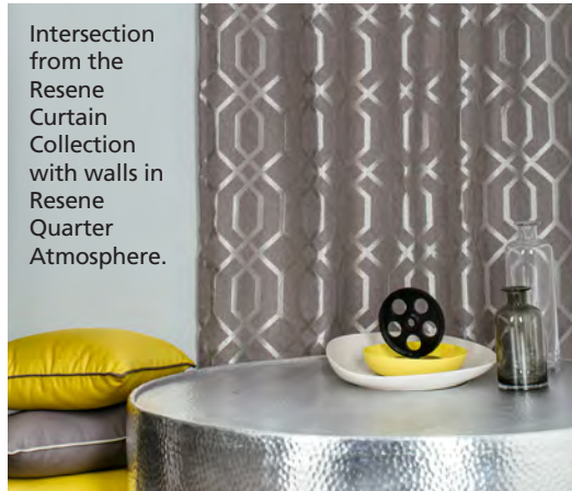
Intersection from the Resene Curtain Collection with walls in Resene Quarter Atmosphere.

Colour co-ordinate: Create your own geo-inspired wall art with a mix of Resene testpots, available in a huge range of colours.