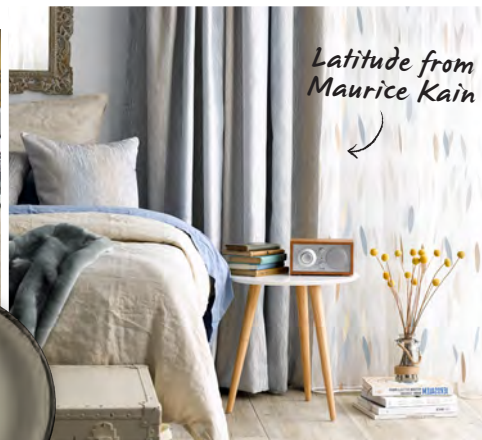
Latitude from Maurice Kain