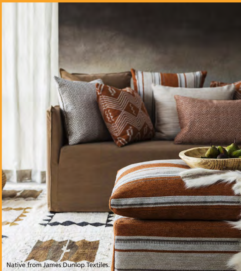
Native from James Dunlop Textiles.

Colour co-ordinate: Try Resene Celebrate as a feature wall, a spicy turmeric yellow. Or try an earthy ombre effect with a selection of Resene colours.