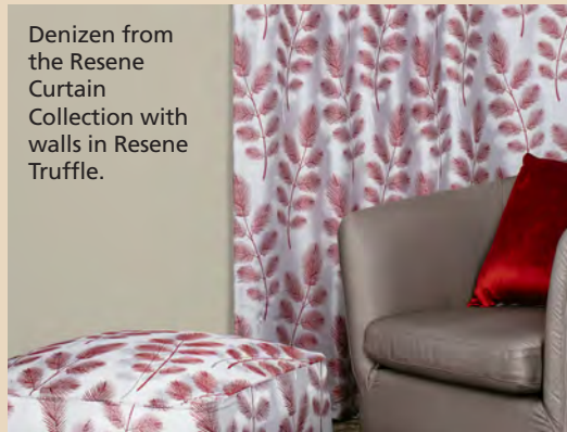
Denizen from the Resene Curtain Collection with walls in Resene Truffle.

Vibrant green is a mainstay colour, accented with energetic, up-beat colours like orange and yellow.