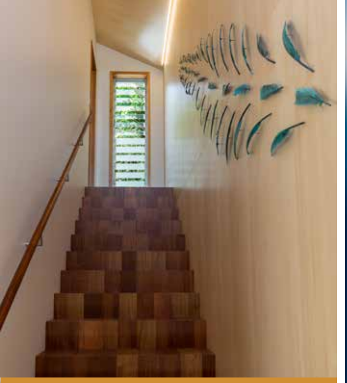
Above: The design team found a number of clever and striking ways to incorporate parts of the original cottage into the new addition. Plywood walls and ceiling finished in Resene Colorwood Whitewash, other walls in Resene Half Merino, reclaimed timber stairs sealed in Resene Qristal ClearFloor 1K and trims sealed in Resene Oristal Clear.