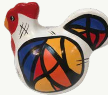
Resene Lightning Yellow

Yvonne’s Sutherland’s brood of ceramic Happy Hens, cheerfully painted in Resene colours, are all they are cracked up to be.