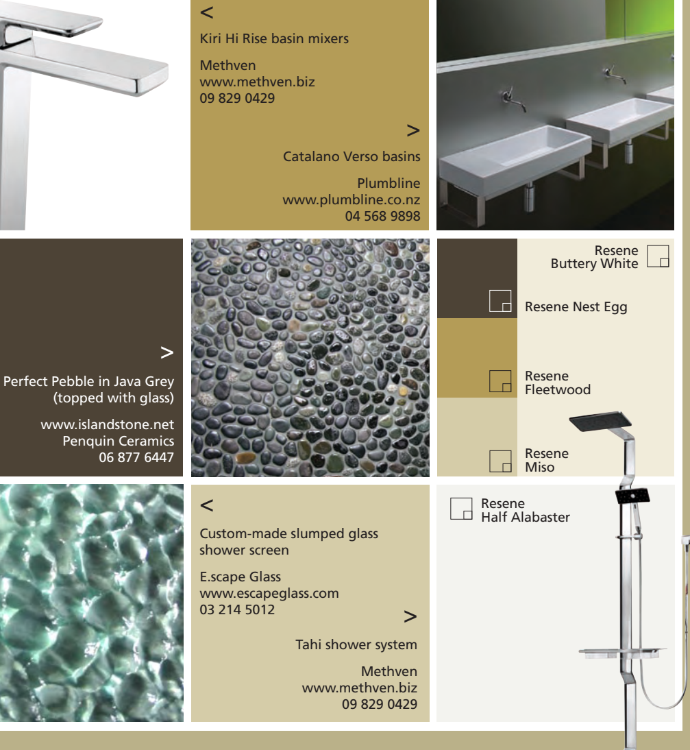
illustration Malcolm White