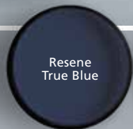
Resene True Blue