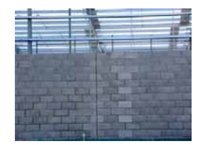
Concrete blocks / blockwork