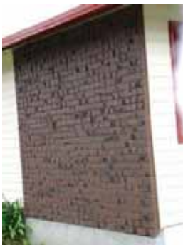
Clinker brick style.