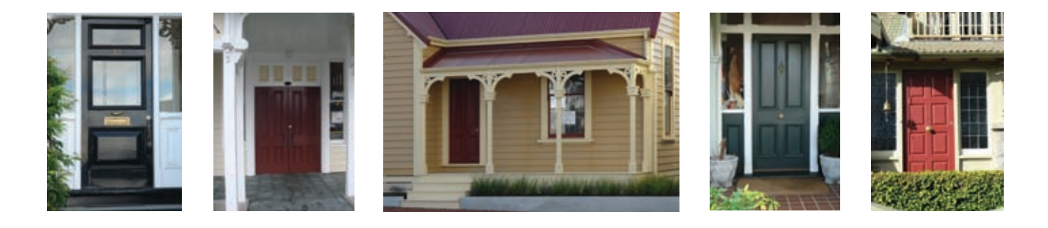
High gloss feature doors and joinery