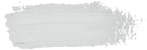
RESENE Eighth Truffle