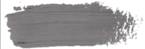
RESENE High Tea