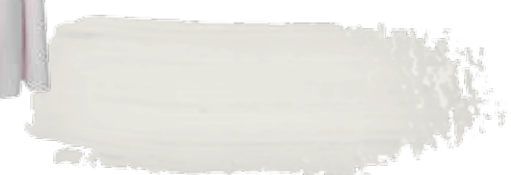
RESENE Eighth Joss (on walls)