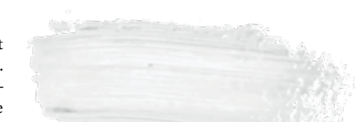
RESENE Eighth Black White