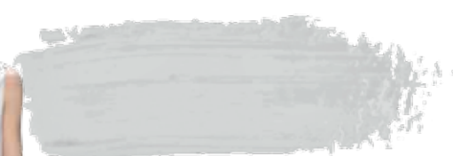
RESENE Double Concrete