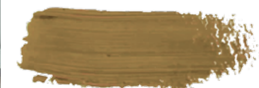
RESENE Brown Sugar