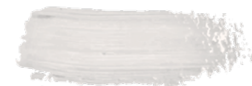
RESENE Eighth Malta