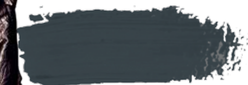
RESENE Gumbboot (on walls)