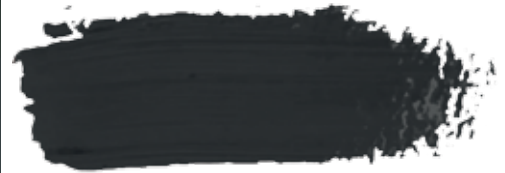
RESENE Half Bokara Grey