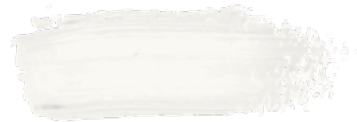
RESENE Pearl Lusta