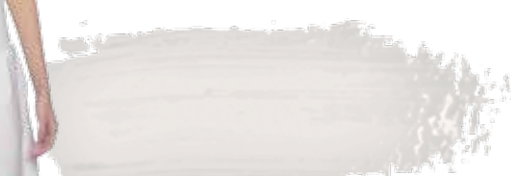
RESENE Double Black White