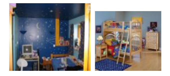
floors + walls + ceilings

Electric blankets are not recommended for small children.