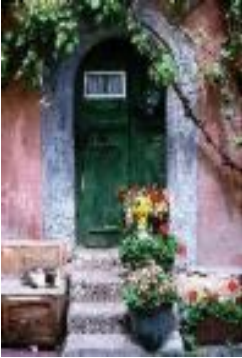
doors + access

Once inside the door a small table in the entrance to put keys, mail or messages on is handy, and somewhere to hang coats and stow umbrellas is also useful. Some homeowners have a 'no shoes inside' policy so a large basket or cupboard for shoe storage works well in this area if room permits.