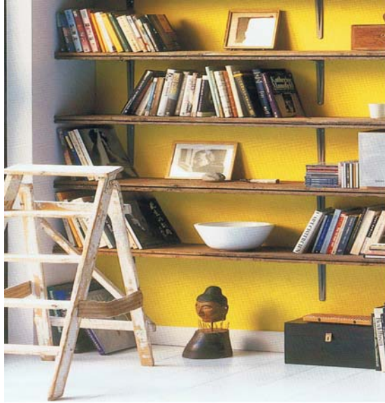
Narrow shelves for books and ornaments work well in a passage way.