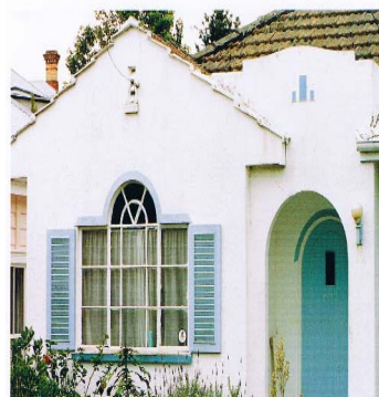
security + safety

Both the style of the door and handles should support the architecture of the building.