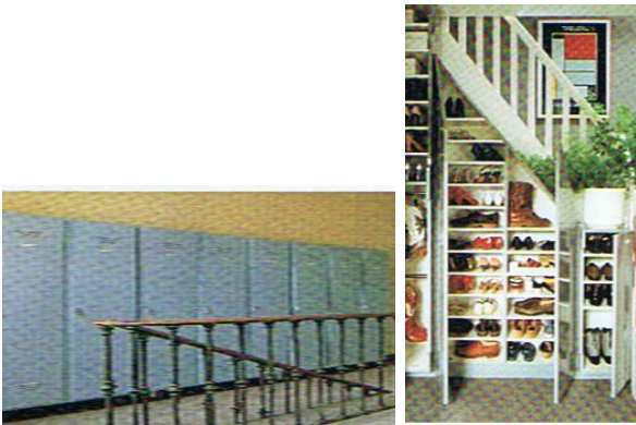
under stair storage

Some modern homes today have glass bricks, polished concrete or industrial steel stairs, which can be noisy and slippery so take care if considering these materials.