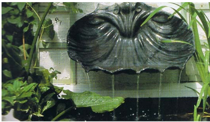
light + sound

The play of light adds to the vibrancy and subtlety of the colour contrasts created by plants and man-made structures in your garden. Varying qualities of light at different times of the day and seasons either suppress or enhance colours.