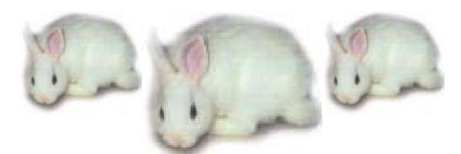
soft fluffy warm cuddly

White on white schemes became popular in the 1920's and 1930's, partly as a result of the introduction of a bright and stable titanium oxide. The idea caught on and rooms everywhere were being painted in shades of white with touches of gold and glass accessories that shimmered in the white light.