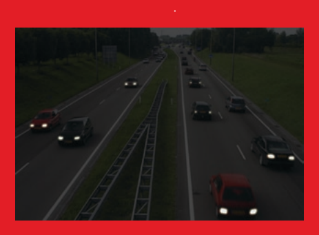
What if it is nearly nightime and the sun has almost gone?