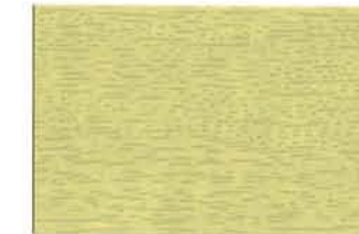
Pea Soup 10CW41