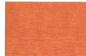
Peach Schnapps 10CW29