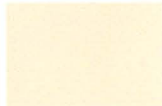
Rock Salt (blonding) 10CW25