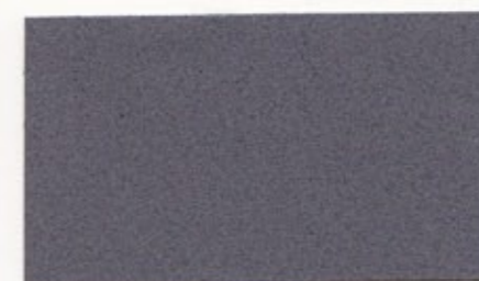
* BRIGHT GREY