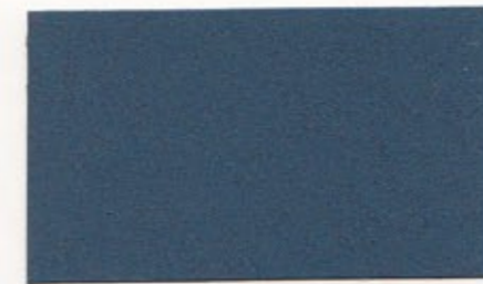
* SILVER BLUE