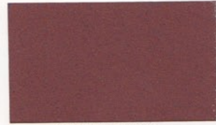
* METALLIC COPPER