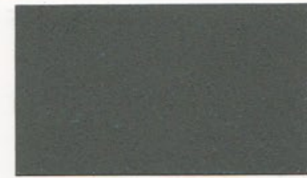
* METALLIC GREEN