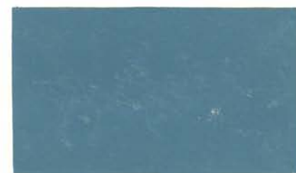
DRESDEN BLUE (MIST GREY UNDERCOAT)