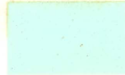
ICE BLUE (WHITE UNDERCOAT)