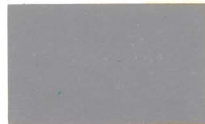
SHALE (MIST GREY UNDERCOAT)