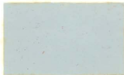
SHADOW CLUE (MIST GREY UNDERCOAT)