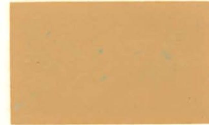
BAMBOO (BAMBOO UNDERCOAT)