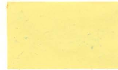
CHARTREUSE (WHITE UNDERCOAT)

The colours on this card are as close to the actual paint colours as modern printing processes allow