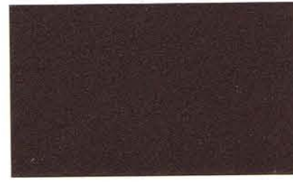
* SILVER BROWN