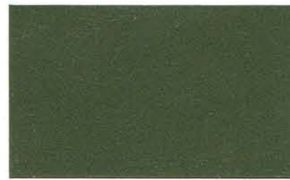
* METALLIC GREEN