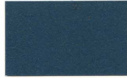
* SILVER BLUE