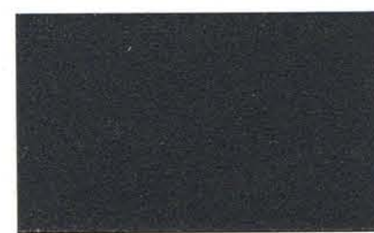
* BRIGHT CHARCOAL