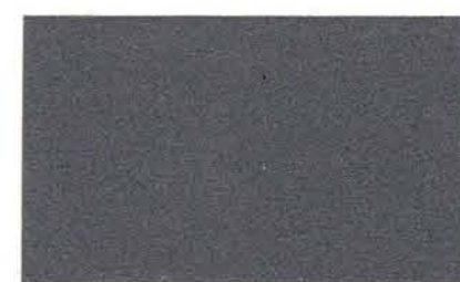
* BRIGHT GREY