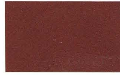
* METALLIC COPPER