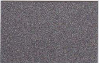
Blast Grey 3™ (Friar Grey) M55-002-072