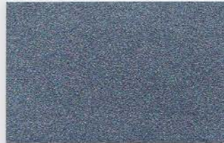
Dalek™ (Kashmir Blue) M46-028-246