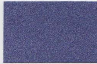
Digital Blue™ (Astronaut) M40-046-279