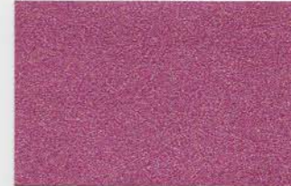
Enchanted™ (Rouge) M60-078-344