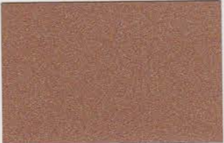
Copper Fire™* (Wild West) M57-064-045