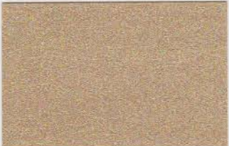
Blast Yellow™ (Quasar) M48-058-063