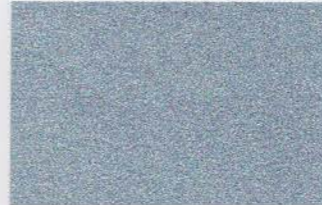
Scotty Silver™ (Shinto) M76-026-239