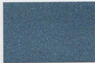
Lucifer™ (Teal Blue) M40-037-226