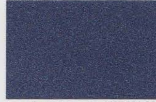
Sputnik™ (True Blue) M37-031-265