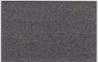
Deep Space™ (Masala) M51-009-077