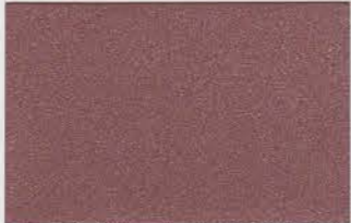
Copperhead™ (Lumberjack) M47-038-039