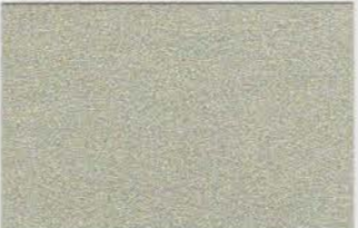
Stun™ (Coriander) M78-034-108