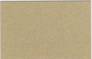
Gold Dust™* (Apache) M69-066-078