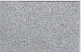
Silver Aluminium™ (Silver Chalice) M83-003-232