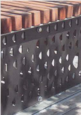
Resene Blast Grey 3