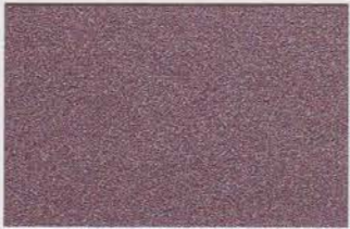
Galaxy™ (Cosmic) M50-027-007