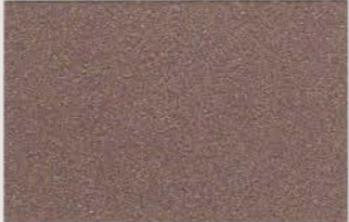
Spark™ (Domino) M45-033-062