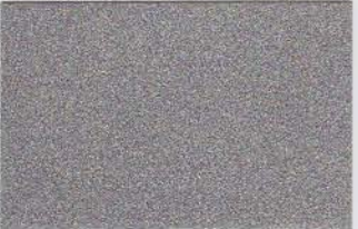
Aluminium™ (Stack) M71-005-087