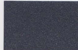
Pearl Shimmer™ (Nero) M36-007-258