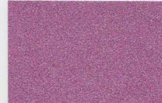
Sugar And Spice™ (Strikemaster) M67-062-336