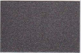
Blast Grey 2™ (Tundora) M44-006-075