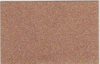
Bullion™* (Porsche) M67-080-068