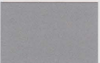
Silver Steel™ (Half Stack) M67-001-338