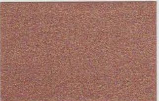
Magma™* (Root Beer) M59-074-060