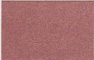
Copper Fire™* (Wild West) M57-064-045