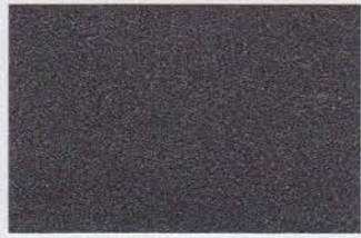
Catch 22™ (Zeus) M35-004-106