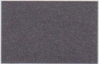
Basalt™ (Zulu) M43-005-325