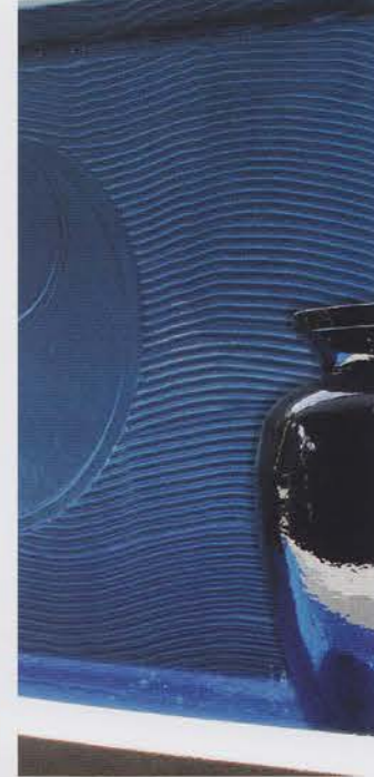
Resene Zoop De Loop