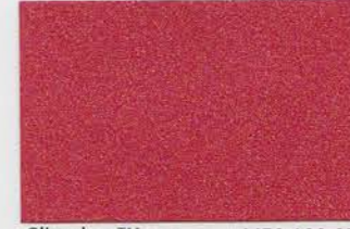
Glitterbug™ (Pirate) M50-100-022