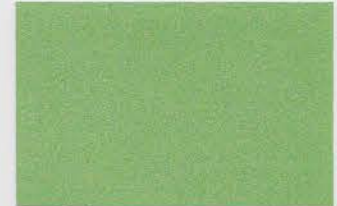
Go Go Go™ (Anise) M73-080-131

A basecoat is recommended for all Resene Metallics and special effects colours. The recommended basecoat is shown in brackets after the colour name. Resene Pearl Shimmer may be applied over a variety of basecoat colours for different effects. It is shown here over Resene Nero.