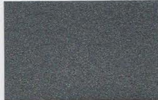
Mica™ (Mangrove) M37-011-188