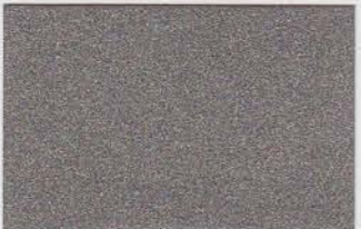
Pure Pewter™ (Chicago) M60-015-085