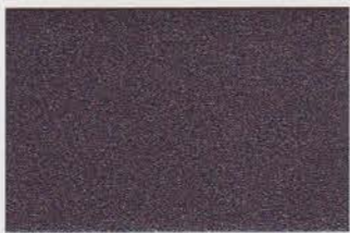
Light Year™ (Woody Brown) M34-014-338