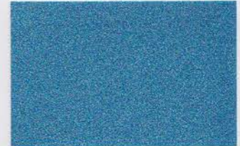
Zoop De Loop™ (Tory Blue) M52-085-267