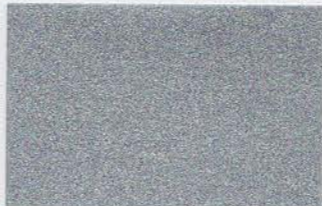
Infinity™ (Regent Grey) M67-010-213