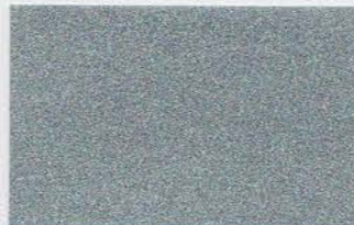
Obelisk™ (Blue Smoke) M64-015-199