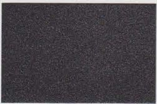
Blast Grey 1™ (Shark) M34-004-071