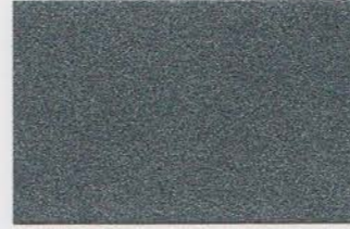
Pioneer™ (Espirit) M46-015-178