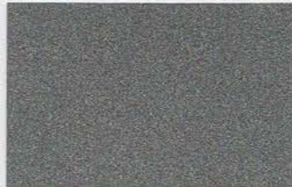
Magnetic™ (Raptor) M46-016-114