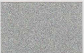
Proton™ (Copyrite) M80-013-107