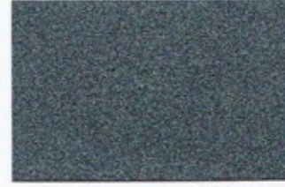
Pioneer™ (Espirit) M46-015-178