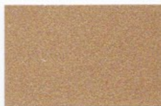
Gold Dust™* (Apache) M69-066-078