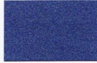
Time Warp™ (Astronaut) M49-055-264