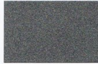
Magnetic™ (Raptor) M46-016-114