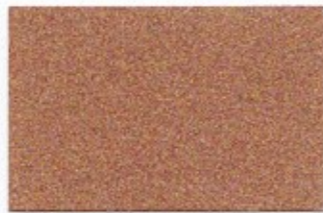
Bullion™* (Porsche) M67-080-068