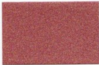
Copper Fire™* (Wild West) M57-064-045