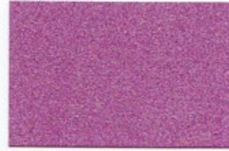
Sugar And Spice™ (Strikemaster) M67-062-336