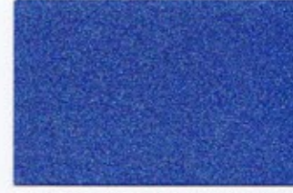
Zoop De Loop™ (Tory Blue) M52-085-267