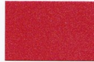
Glitterbug™ (Pirate) M50-100-022