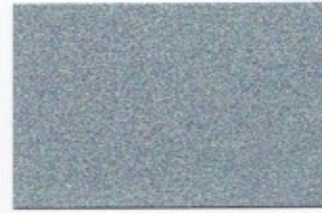
Obelisk™ (Blue Smoke) M64-015-199