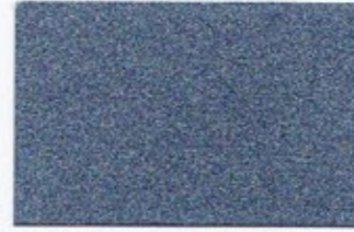
Dalek™ (Kashmir Blue) M46-028-246