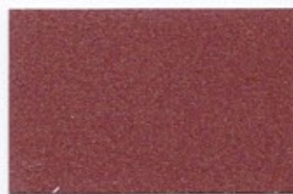
Copperhead™ (Lumberjack) M47-038-039