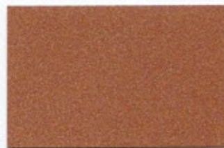
Blast Yellow™ (Quasar) M48-058-063