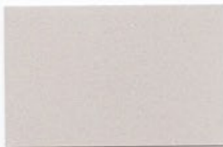
Bedrock™ (Tea) M77-016-085