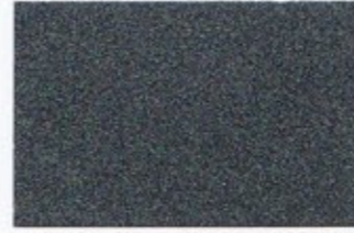
Mica™ (Mangrove) M37-011-188