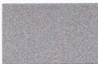
Aluminium™ (Stack) M71-005-087