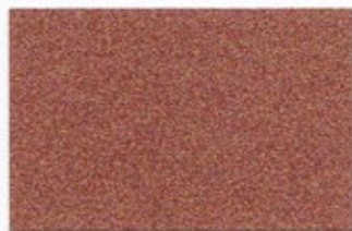
Magma™* (Root Beer) M59-074-060