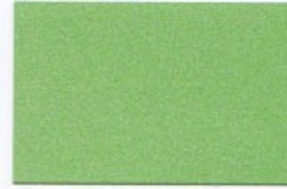
Go Go Go™ (Anise) M73-080-131

A basecoat is recommended for all Resene Metallics and special effects colours. The recommended basecoat is shown in brackets after the colour name. Resene Pearl Shimmer may be applied over a variety of basecoat colours for different effects. It is shown here over Resene Nero.