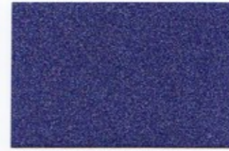
Digital Blue™ (Astronaut) M40-046-279