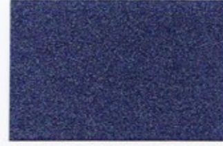
Sputnik™ (True Blue) M37-031-265