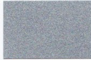
Infinity™ (Regent Grey) M67-010-213