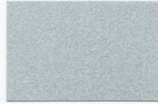
Allusive™ (Gull Grey) M74-008-201