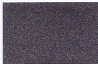
Basalt™ (Zulu) M43-005-325