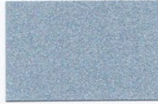
Scotty Silver™ (Shinto) M76-026-239