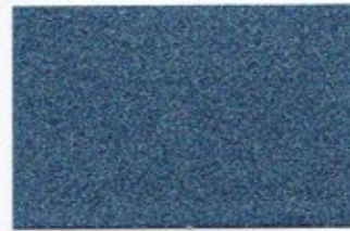
Lucifer™ (Teal Blue) M40-037-226