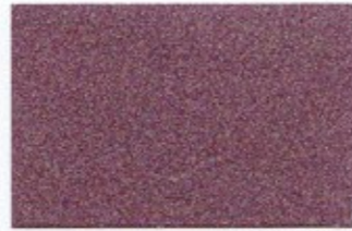
Galaxy™ (Cosmic) M50-027-007