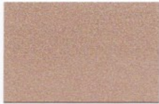
Goldmine™ (Dusty Road) M68-046-067