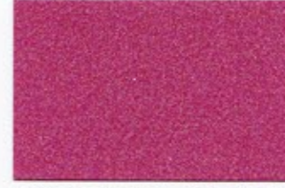
Bedazzle™ (Rouge) M54-081-355