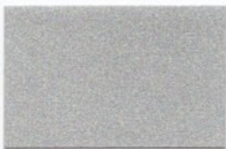
Proton™ (Copyrite) M80-013-107