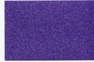
Funtasia™ (Daisy Bush) M48-091-301