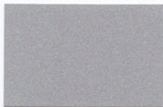
Silver Steel™ (Half Stack) M67-001-338