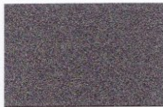
Deep Space™ (Masala) M51-009-077