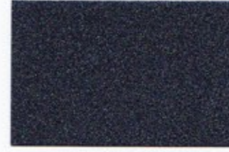
Pearl Shimmer™ (Nero) M36-007-258