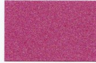
Enchanted™ (Rouge) M60-078-344