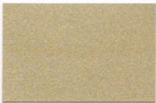
Gold™* (Gimblet) M70-060-089