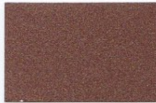
Spark™ (Domino) M45-033-062