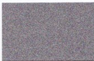
Blast Grey 3™ (Friar Grey) M55-002-072