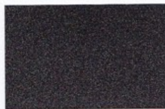
Catch 22™ (Zeus) M35-004-106