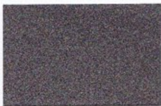
Blast Grey 2™ (Tundora) M44-006-075