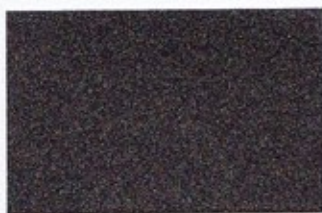
Blast Grey 1™ (Shark) M34-004-071