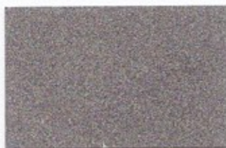
Pure Pewter™ (Chicago) M60-015-085