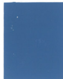
DRESDEN BLUE (MIST GREY UNDERCOAT)