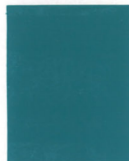
SHERWOOD GREEN (LAUREL UNDERCOAT)