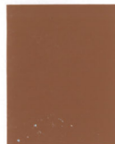
LEATHER (DUSKY PINK UNDERCOAT)