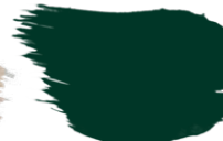
Resene Palm Green