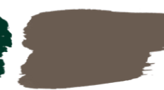
Resene Triple Stonehenge