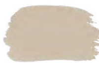
Resene Half Bison Hide