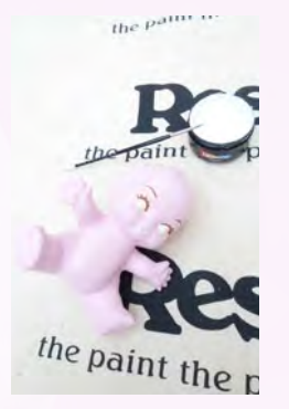
Step four Paint the whites of each eye with Resene Alabaster, as shown, and allow to dry.