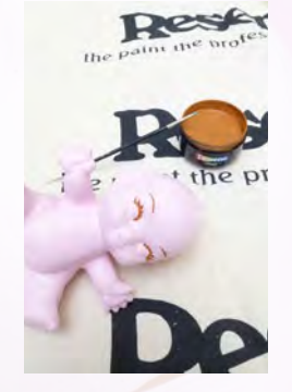
Step threePainteyelasheseyebrowswithReseneRootBeer and allow to dry.