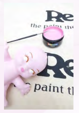
Step five Paint the lips with Resene Hopskotch and allow to dry.