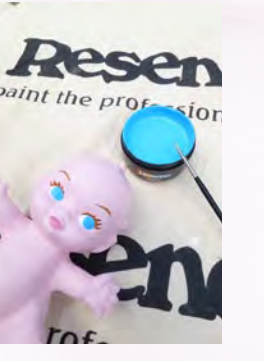
Step six Paint the iris of each eye with Resene Sports Star and allow to dry.