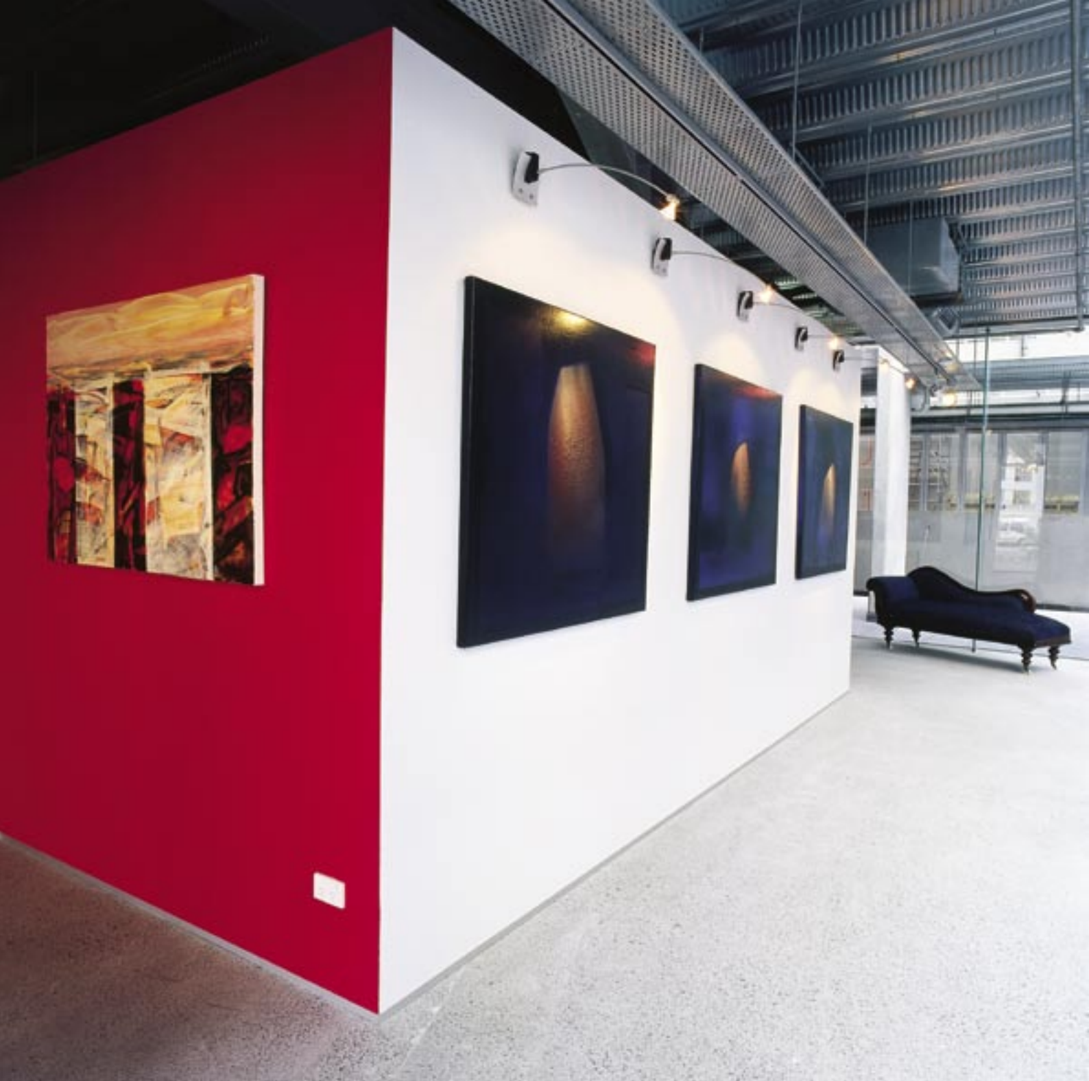
Above: Resene supplied a variety of surface solutions for Zone 23. This art gallery is finished in Resene White Linen and Resene Roadster, both from the Resene Total Colour System.

In keeping with the overall theme of interesting, low-maintenance finishes, paint was specified in both vibrant and earthy tones, and in an easy-to-clean composition.