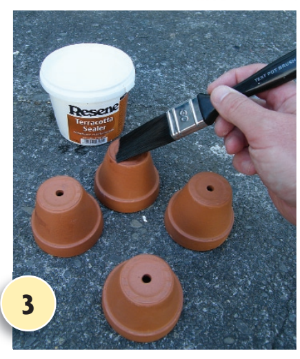
Apply one coat of Resene Terracotta Sealer to the pots and allow to dry