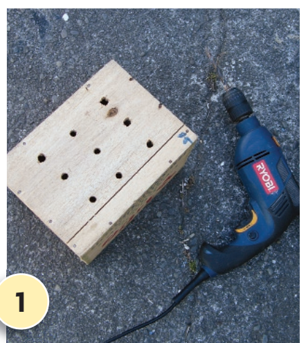
Drill drainage holes in the base of the wooden box, as shown.

For more on paints phone o8oo RESENE (08oo 737 363) or visit www.resene.co.nz