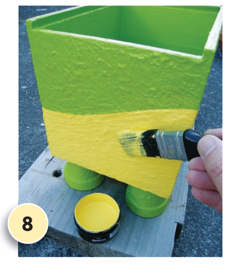
Paint the top half of the outside with two coats of Resene Limerick, and the bottom half with two coats of Resene Wild thing, making a curved upper line. When all paint is thoroughly dry, fill the box with bulb potting mix and plant your bulbs.