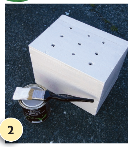
Apply one coat of Resene Quick Dry to the inside and outside of the entire box and allow two hours to dry.