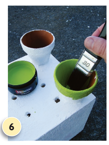
Paint the feet with two coats of Resene Limerick. As with other paint in this project, allow two hours for each coat to dry.