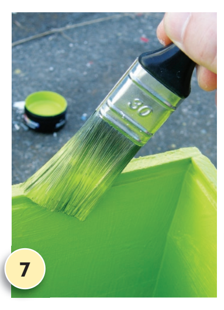
Paint the inside of the box with two coats of Resene Limerick, again allowing two hours for each coat to dry.