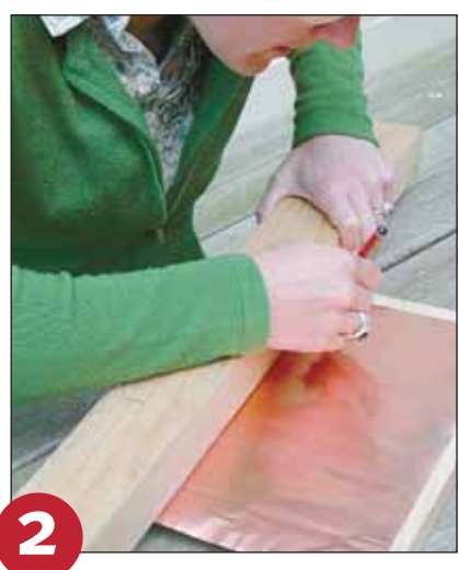
MEASURE a piece of copper to cover your piece of wood. Cut it to size with a pair of tin snips.