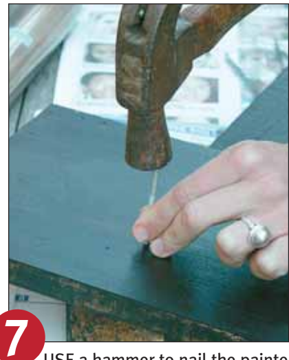
USE a hammer to nail the painted wooden plaque base and the wooden stake together.