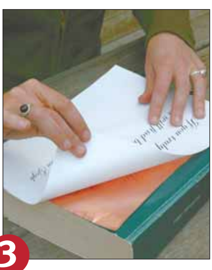
PLACE the copper sheet on top of an old phonebook and lay the type template on top. Sellotape into place.