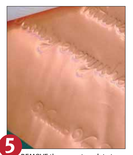
REMOVE the paper template to reveal the engraved plaque. It will develop a lovely patina outdoors.