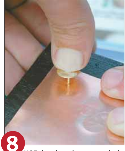
USE drawing pins to attach the copper sheet to the base. Decorate the stake with a strip of copper.