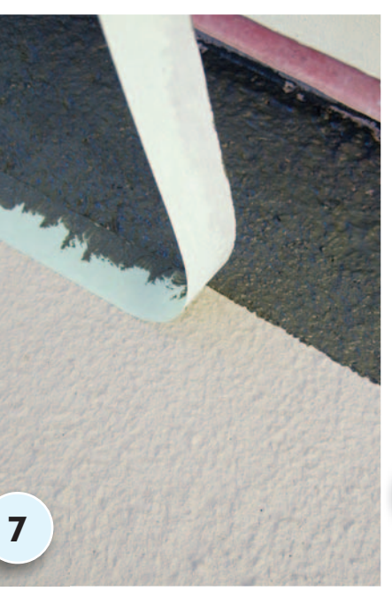
CAREFULLY remove the masking tape.