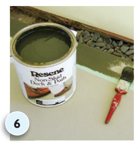
USE an old paintbrush and stippling technique to apply one coat of Resene Helter Skelter to the masked-off strip. Allow to dry and apply a second coat. Repeat steps five and six until all edges of the patio area are painted.