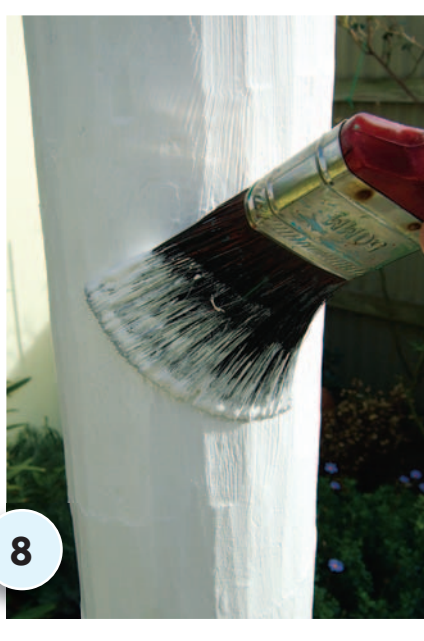
COMPLETE the makeover by applying two coats of Resene Alabaster to the adjacent pergola legs and trellising.