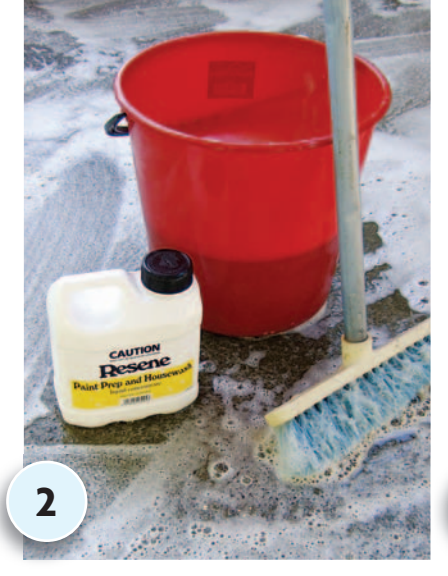
RINSE off the Resene Moss & Mould Killer with clean water, then mix one part Resene Paint Prep and Housewash with three parts clean water. Use this to clean the concrete patio using a stiff brush. Once the concrete is clean, rinse it off with clean water.