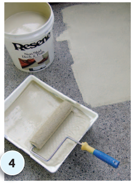
USING the hi-solids roller, apply one coat of Resene Abanakee to the concrete surface. Allow to dry for a minimum of three hours before applying a second coat.