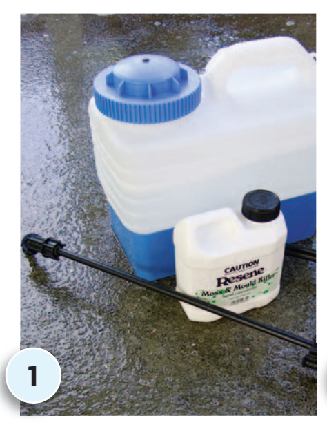
MIX one part Resene Moss & Mould Killer to five parts clean water and apply generously to the concrete patio with a garden sprayer. Leave for 48 hours.